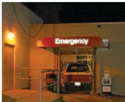
Overused ERs: A man in Kelowna drove into the ER; five million Canadians don’t have a doctor