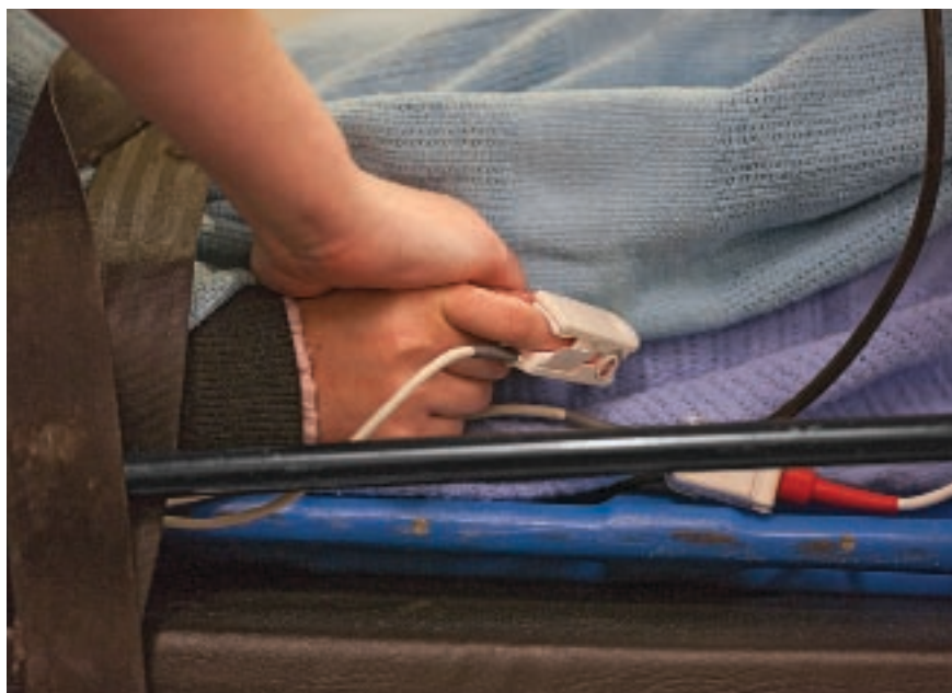
No drug program: One in 10 Canadians report not filling a prescription because of the cost