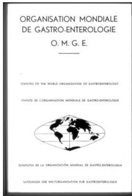
Figure 3: The first O.M.G.E. Statutes

The Statutes have been modified many times since the approval of the first ones in 1963, but the aims of O.M.G.E., as stated there, remain essentially the same, and I believe that we can proudly look back at what has been achieved in the fields of international research, education, training, ethics, and the practice of gastroenterology as well in encouraging and helping in the creation of new Continental Associations.