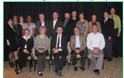
IAB Quebec City